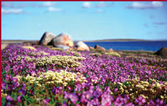
Cambridge Bay