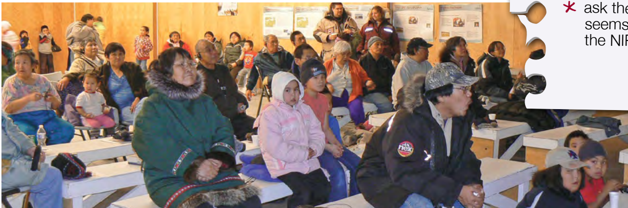
NIRB community meeting, Taloyoak