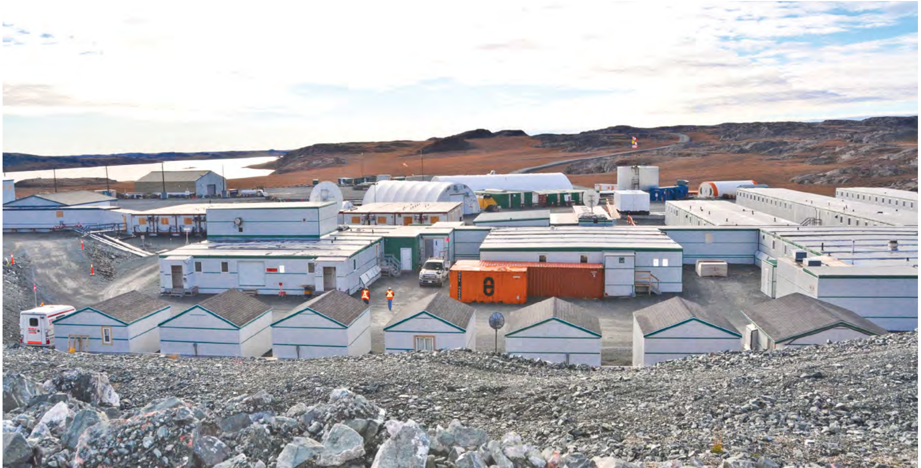
Doris North mine site