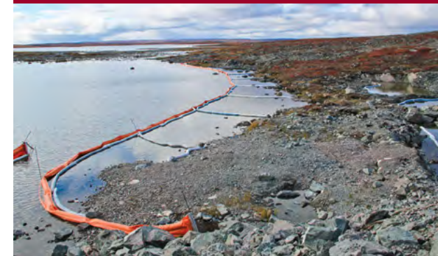
Fuel spill clean up along access road Photo: Sophia Granchinho 2011

(NIRB 2011-2012 Annual Monitoring Report for Agnico-Eagle Mines Ltd.'s Meadowbank Gold Project, p. 24, 2012.)