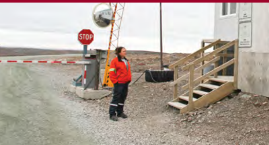
Meadowbank Gold Mine, Gatehouse on Controlled Road

During Monitoring, community members requested use of the road. A new NIRB hearing was held to discuss the issue. As a result, condition 32 was amended to allow "...non-mine use of the road to authorized, safe and controlled use by all-terrain vehicles for the purpose of carrying out traditional Inuit activities." Today, Baker Lake residents have use of the road, managed by Meadowbank according to the amended Project Certificate.